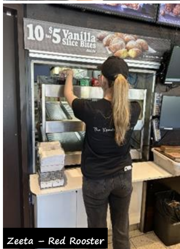
Zeeta - Red Rooster